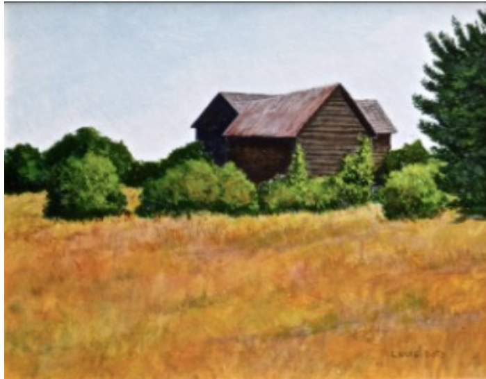
Iseboro Farm Acrylic by Lou Doto