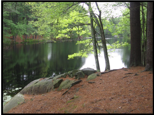
Wood and lakes . .