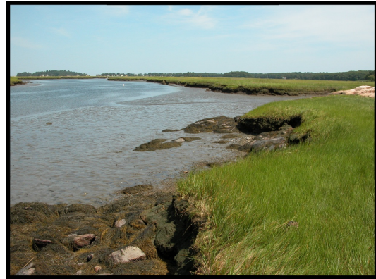
and the waterways