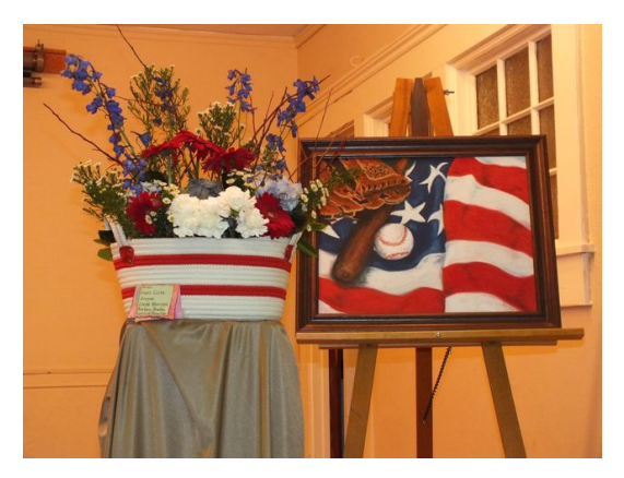
Reading Garden Club's "Art in Bloom" display flower basket with RAA member Keith Curtis's painting.