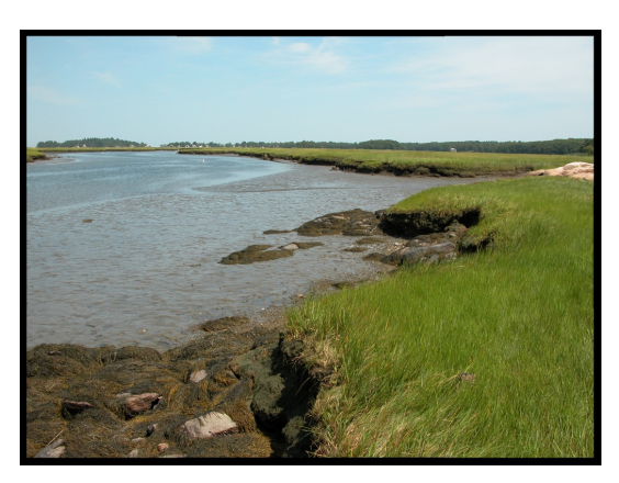
and the waterways